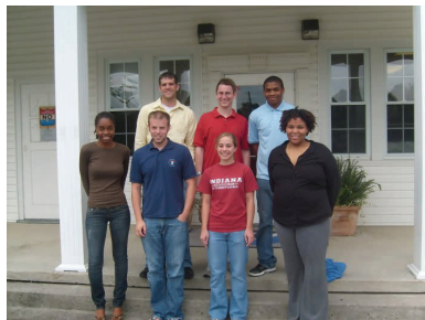
Summer 2009 interns and research assistants pictured at ATDD in Oak Ridge, TN.

Four NOAA scholars (participants in the EPP Undergraduate Scholarship Program and the Ernest F. Hollings Undergraduate Scholarship Program) and one Spelman College Howard Hughes Fellow completed summer internships at the Atmospheric Turbulence & Diffusion Division (ATDD). ATDD is a NOAA Air Resources Laboratory (ARL) field office located in Oak Ridge, TN with a total staff of 40, including 10 scientists. These five summer interns were dedicated and inquisitive, which led to both research mentors and interns broadening their scientific perspectives.