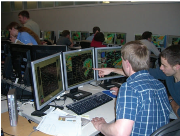
Students participating in the February 2009 DLOC Workshop.

Located in Norman, Oklahoma at the National Weather Center (NWC), the Warning Decision Training Branch (known as WDTB), has been providing training and education to NOAA's NWS forecasters (meteorologists and hydrologists) for almost 20 years. WDTB courses focus on operational warning-related science, technology, and decision making topics. The mission: to transfer knowledge of weather phenomenon into warnings that protect the public from dangers such as tornados, flash floods and winter storms.